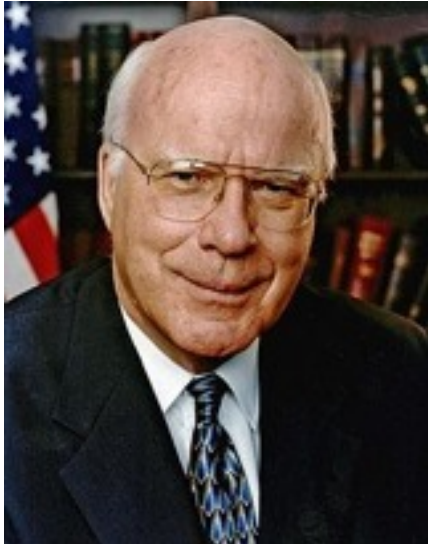
Senator Patrick Leahy (D-VT)

Many in the EB-5 community are already counting the days.